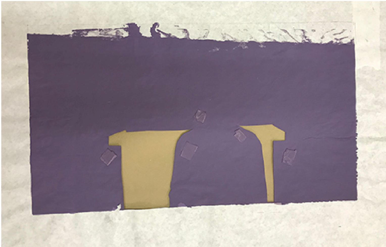
A used paper stencil that has been painted over in purple ink.