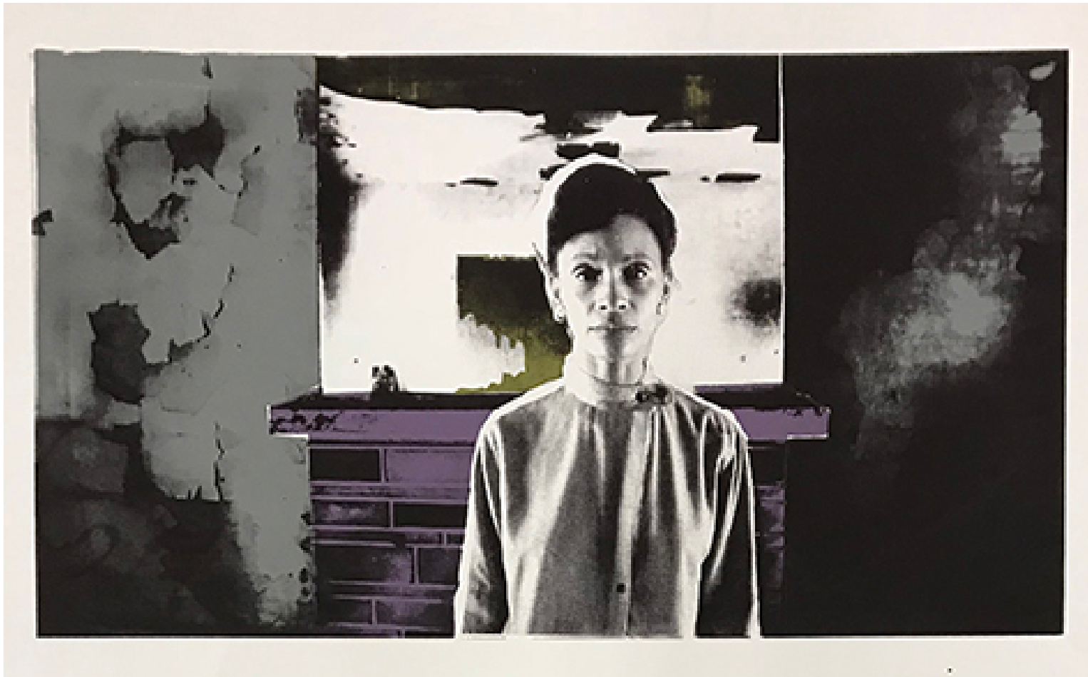
A finished multilayer silkscreen print made using stencils.