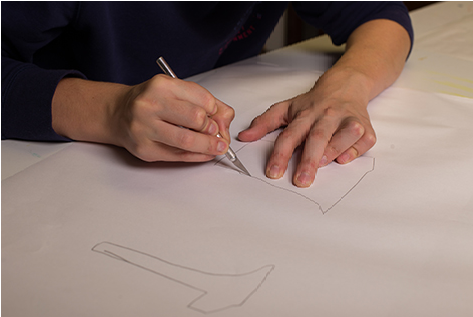
Student using an X-acto knife to cut out shapes for their second stencil.