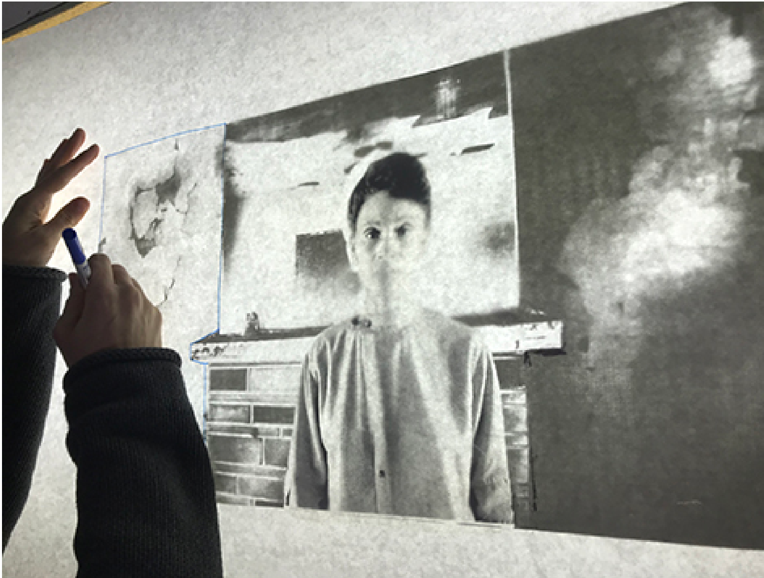
Student using a film positive to trace outlines for their first stencil.